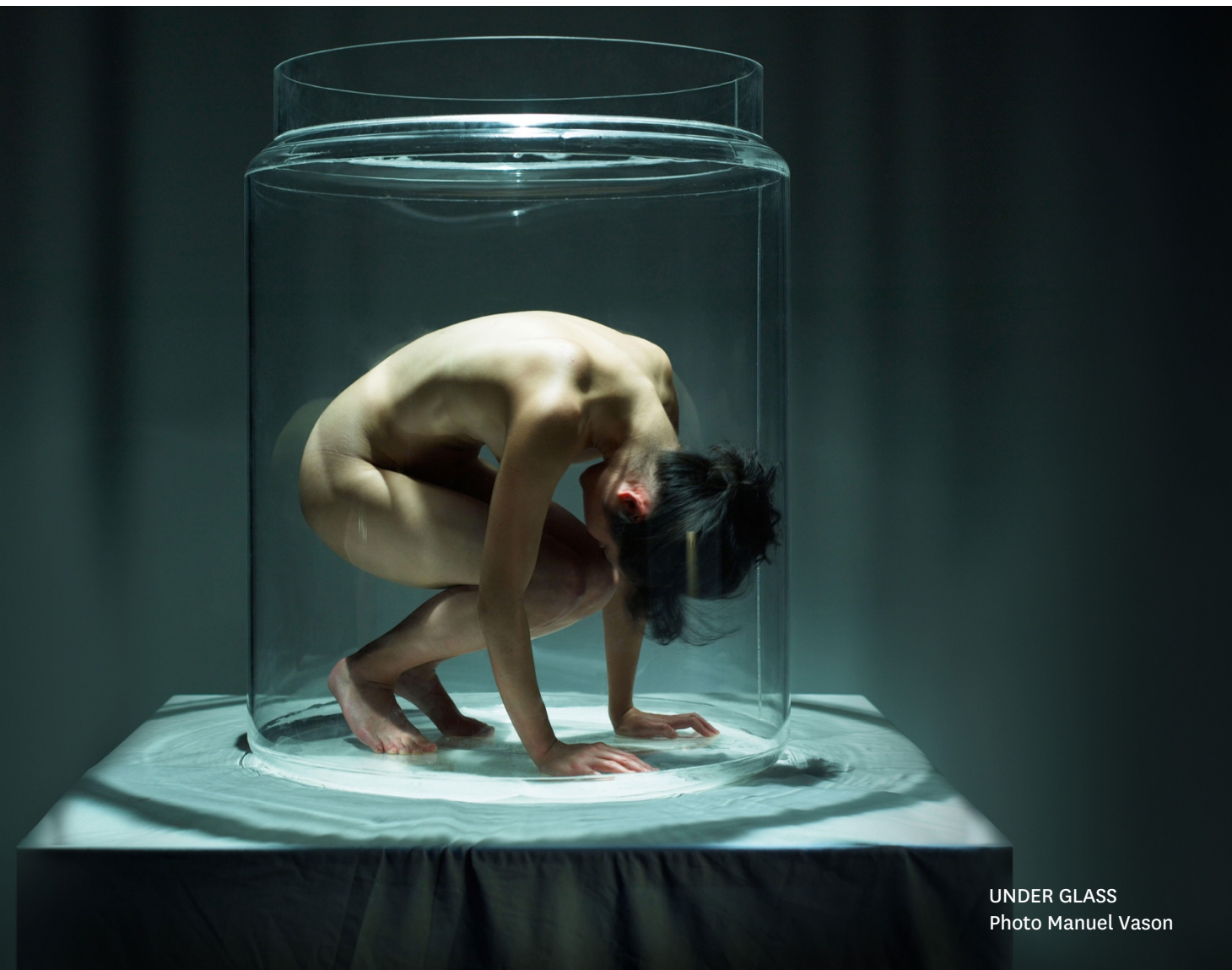
UNDER GLASS